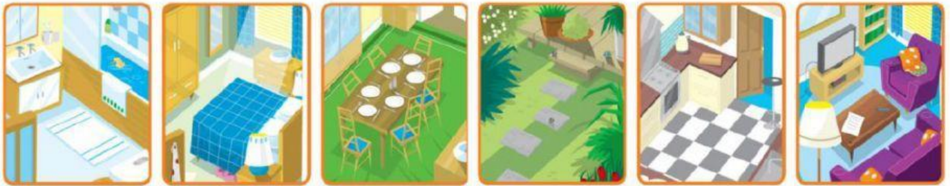
bathroom bedroom dining room garden kitchen living room