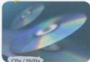
CDs / DVDs