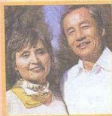
Mr. and Mrs. Aoki

"My twenty-first birthday is on Saturday, and I'm going to go out with some friends. To wish me a happy birthday, they're going to pull on my ear 21 times – once for each year. It's an old custom. Some people pull on the ear just once, but my friends are very traditional!"