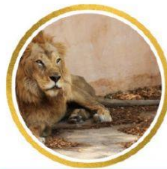
THE LONDON TOWER