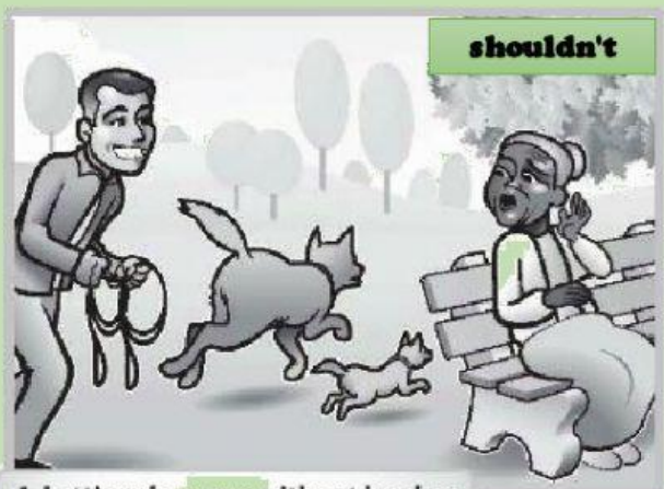
4. Letting dogs run without leashes

1. People shouldn't be allowed to leave large items on the sidewalk.