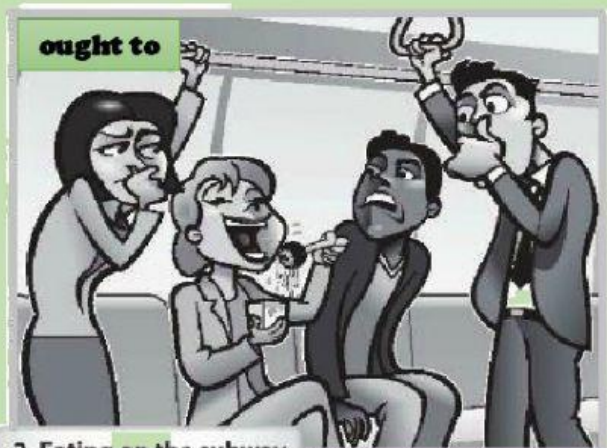
2. Eating on the subway