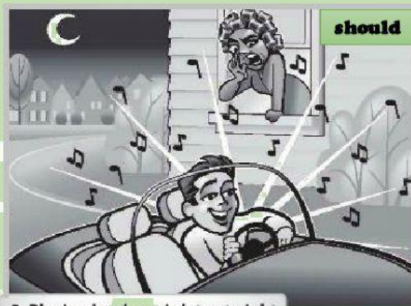
3. Playing loud music late at night