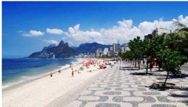
Ipanema Beach in Rio de Janeiro