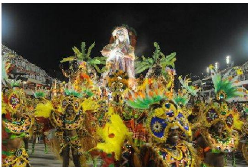
Carnival in Rio

Brazil is known for its cheerful and vibrant atmosphere during Carnival time starting on the Friday before Ash Wednesday. Carneval do Brasil is celebrated in many cities such as in Sao Paolo, Salvador or Rio de Janeiro.