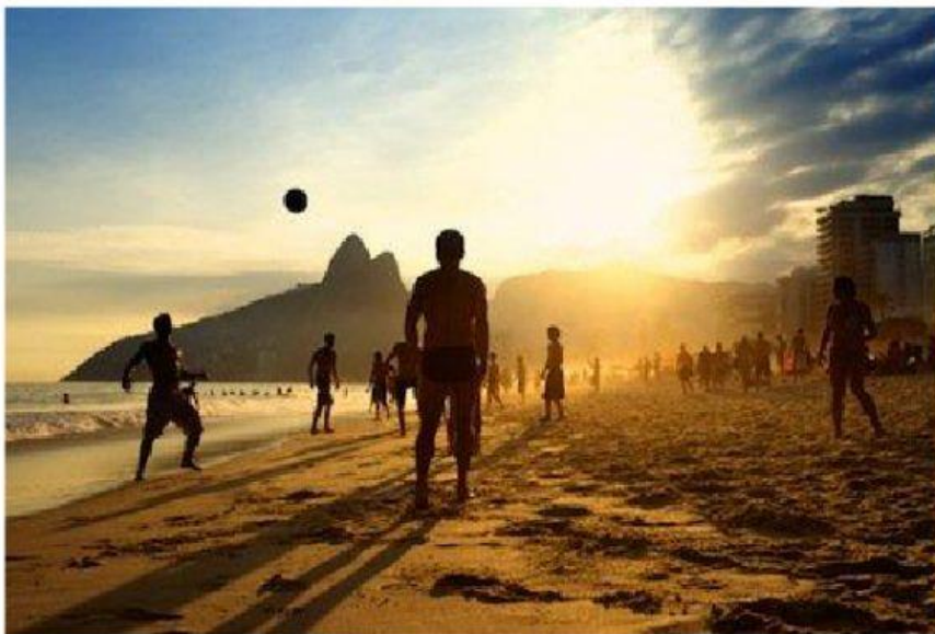
Kids playing soccer on the beach in Brazil

The people in Brazil love being outdoors, the main sports are soccer, volleyball and water sports.