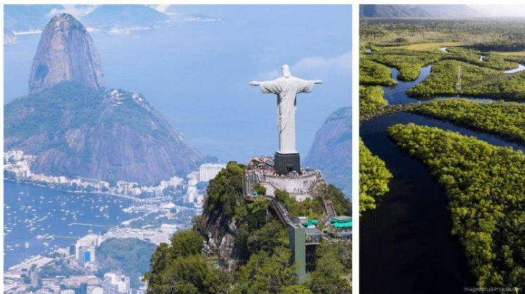
Rio de Janeiro - Amazonas