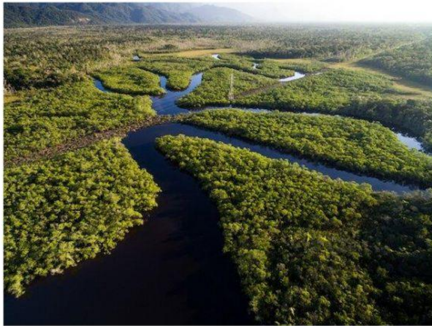
Amazon rainforest in Brazil