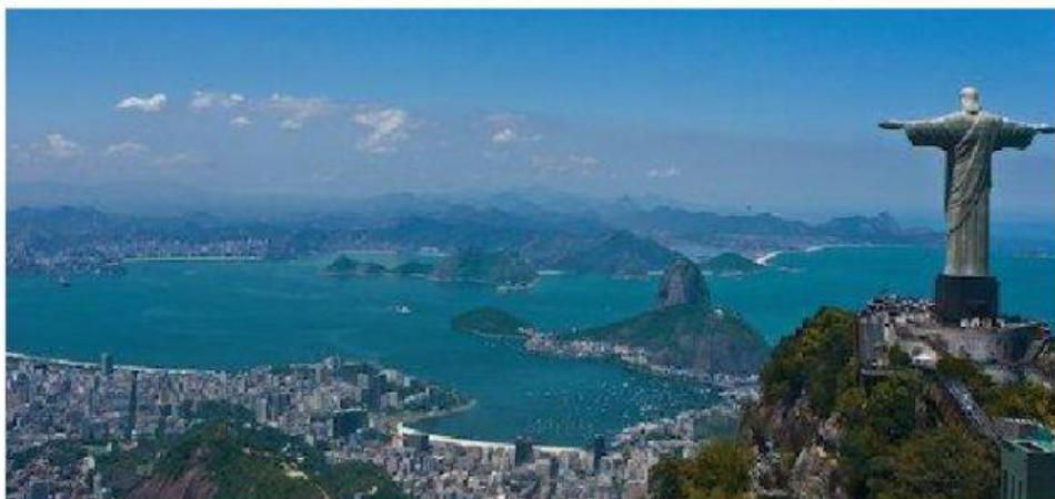
Rio de Janeiro in Brazil