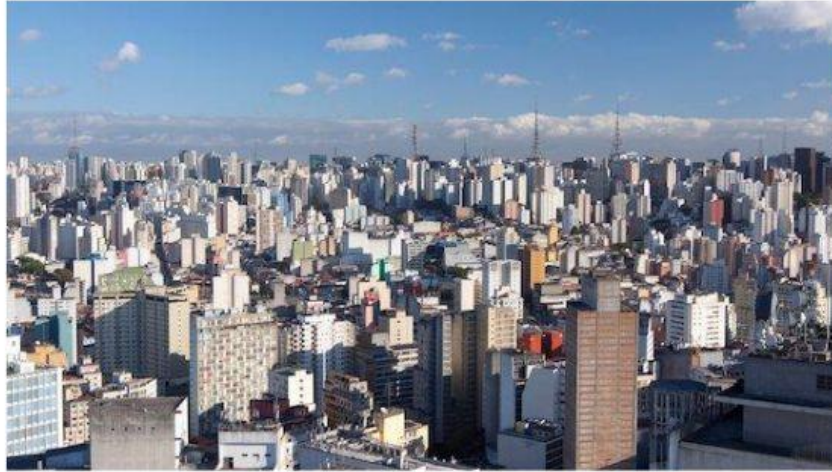
Sao Paulo, the most populous city of Brazil

The biggest cities in Brazil are Sao Paulo, Rio de Janeiro and Brasilia. The Brazilian cities are known for the extensive favelas . These are the neighbourhoods or shanty towns, where mainly poor people live.