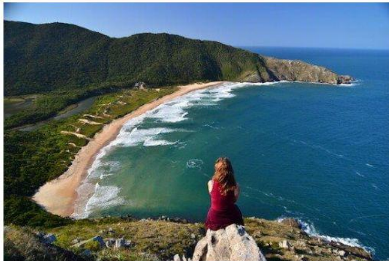
Santa Catarina island

Florianópolis is located on Santa Catarina Island which stretches over 54 km/ 33 miles. The island has some of the most amazing beaches in the country.