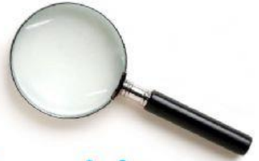
hand lens (magnifying glass)