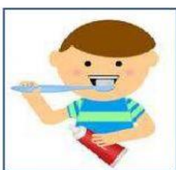
Brush my teeth