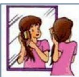
Brush my hair