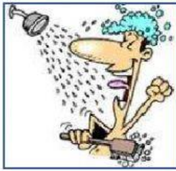
Take a shower