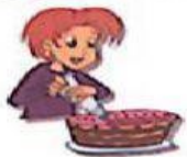
making a cake