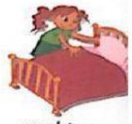
making the bed