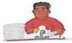
doing the washing-up