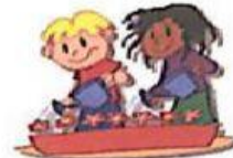
watering the plants