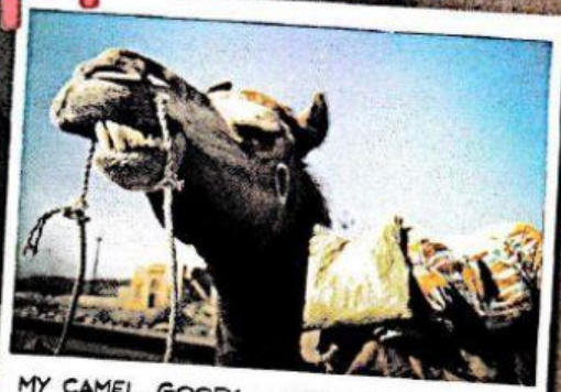
MY CAMEL, GOOFY