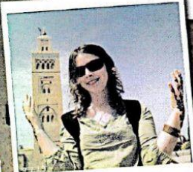
OUTSIDE THE MARRAKECH SOUQ WITH MY HENNA TATTOOS