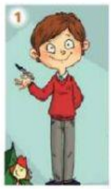
PICK IT UP