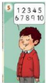
COUNT TO 10