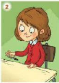
PUT IT DOWN