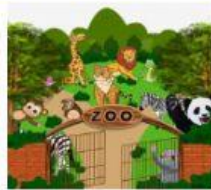
at a zoo