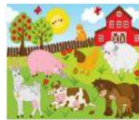
on a farm