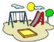
on the playground