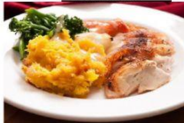
roast chicken, boiled potatoes and And broccoli