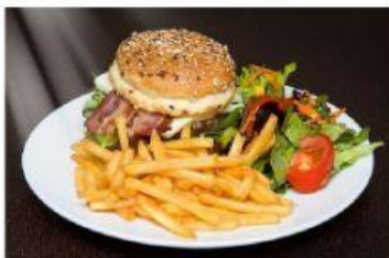
Beef burger, chips and salad