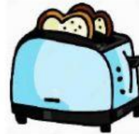
8- T _____