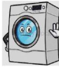
3- W _____ M _____