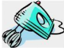
7- M _____