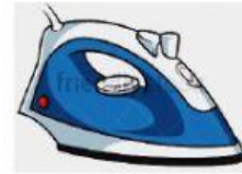
9- I _____