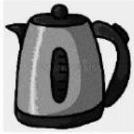
1- K _____