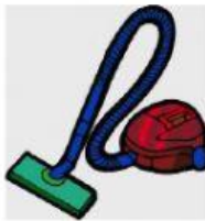
10- V _____ C _____