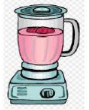
5- B _____