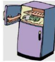
4- F _____