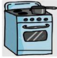
2- C _____