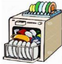
11- D _____