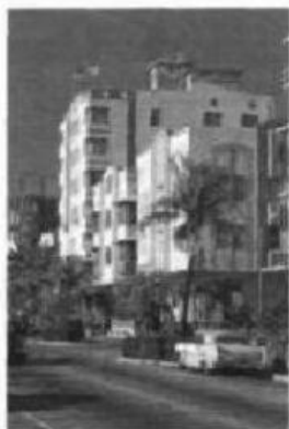
▲ Ocean Drive Miami Beach

just let me confirm the details could you spell your surname there's an additional charge can I have your name can I help you