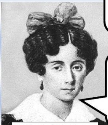
María Sánchez de Thompson

I _____ Manuel Belgrano. I was born in 1770, in Buenos Aires. I am part of the _____ Government Board.