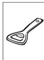
5 _____ _____