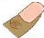
Width of a finger nail