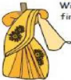
Length of a Sari