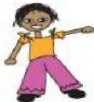
Height of a child