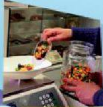
Candy & snacks