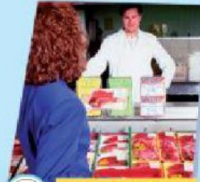
Meat & fish