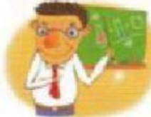
He's a teacher.