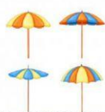
They are umbrellas.