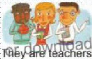
They are teachers.