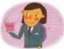
She is a student.