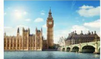
I) The Big Ben