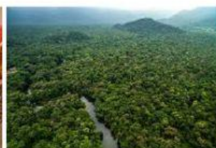
C) Amazon Jungle