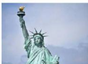
A) The Statue of Liberty