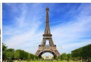
E) The Eiffel Tower