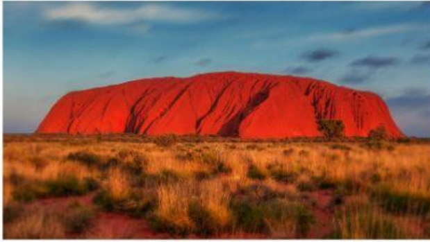
Uluru also known as Ayers Rock