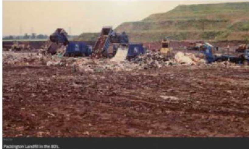
Packington Landfill in the 80s.

Watch this video to find out more about landfill sites.