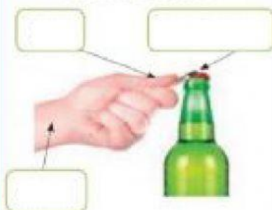
a bottle opener

Some levers have the load in the middle.