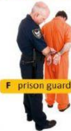
F prison guard