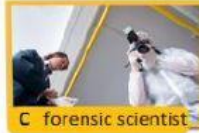
C forensic scientist