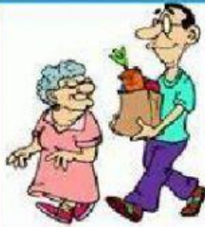
He helps the lady