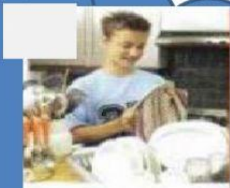
help my parents

What did you do for your family last weekend?