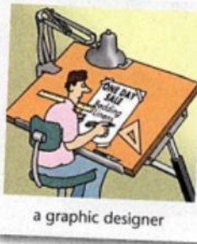
a graphic designer