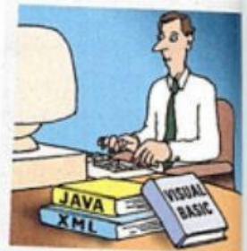
a computer programmer