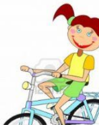
Ride a bike