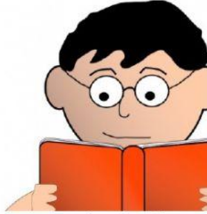
Read a book