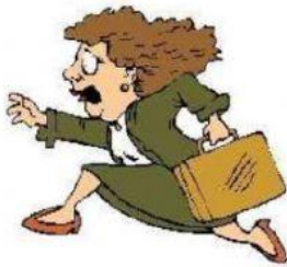
go to work