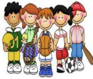
play with friends