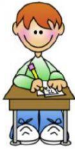
do the homework