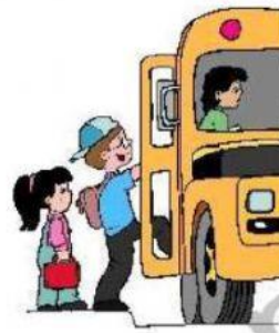
Catch the bus