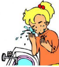
Wash my face