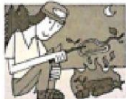
5. cook / fish