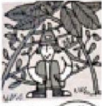
look for (build)