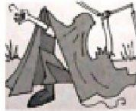
6. chop / camp