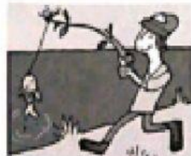
8. fish / sleep