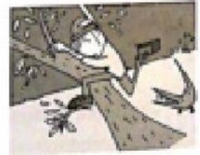
7. hike / climb