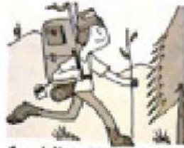
1. hike / build