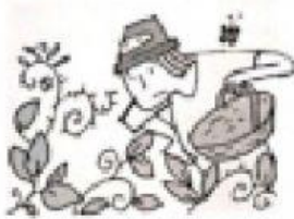
2. look for / sleep