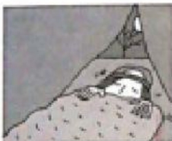
4. climb / sleep