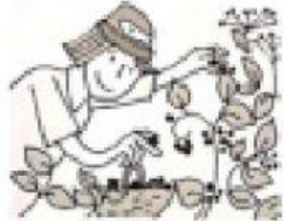
3. cook / find