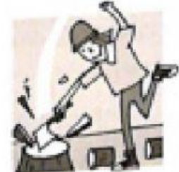
9. chop / find