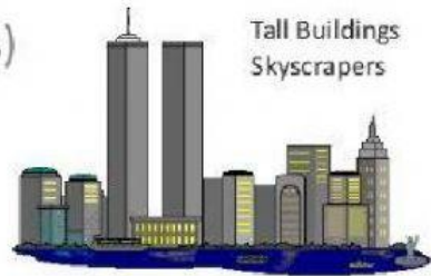
Tall Buildings Skyscrapers