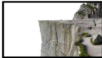
cliff – desert