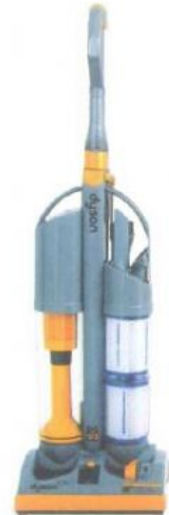
the vacuum cleaner