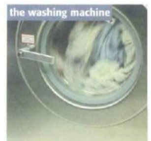
the washing machine