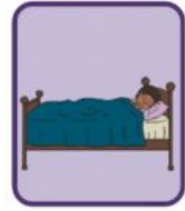
Go to sleep