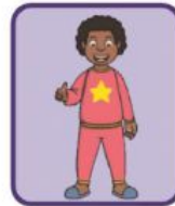
Put on pajamas