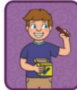
Get your crayons