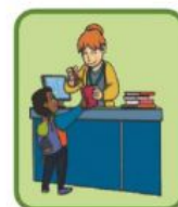
Check-out your book