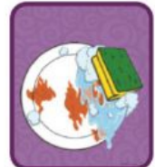
Wash the dirty dishes