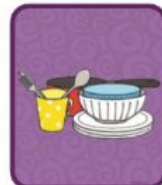
Stack washed dishes