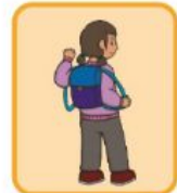
Put on your backpack