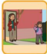
Leave for school