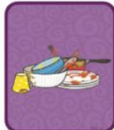
Gather dirty dishes