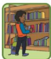
What book do you want?