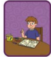
Select a color (green)