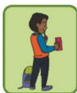
Choose your book