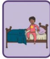
Get in bed