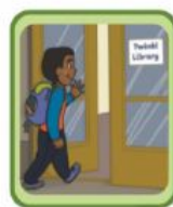
Go to the library