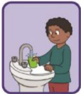
Get a drink of water