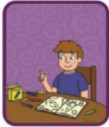
Select a color (blue)