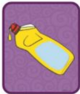
Get dish soap