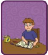
Color blue in your book