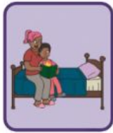
Read a bedtime story