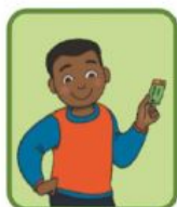
Find your library card