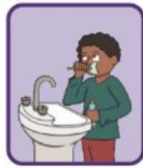
Brush your teeth