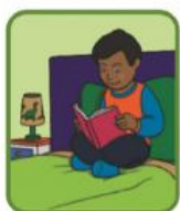
Read your library book