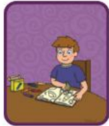
Color green in your book