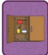
Put dishes away