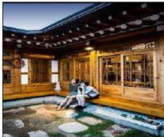
city: Gyeongju plan: stay in Hanok village