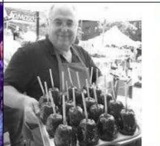
city: V plan: 캔디 애플을 먹다 eat