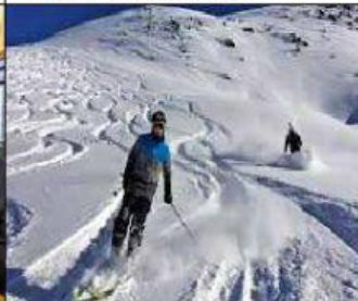
city: Interlaken plan: 알프스에서 스키타다 in the Alps