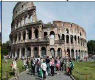
city: plan: visit the Colosseum