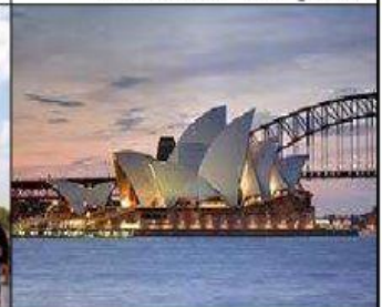
city: plan: visit the Opera house.