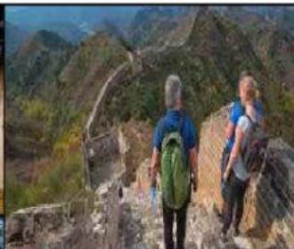
city: plan: walk along the Great Wall.