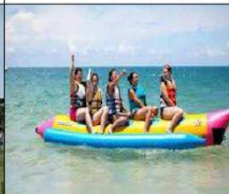
city: Pattaya plan: take a boat ride