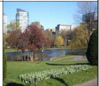
city: Boston plan: 공원에서 산책하다 a walk in the park