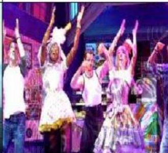
city: London plan: 뮤지컬을 보다 watch a musical