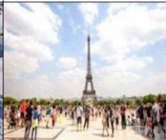
city: plan: 에펠탑을 방문하다 the Eiffel tower