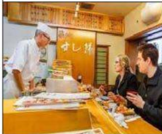
city: T plan: 초밥을 먹다 eat sushi