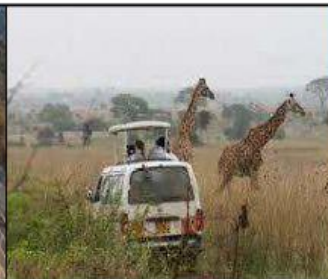
city: N plan: visit the national park