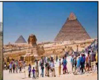
city: plan: visit the Pyramid