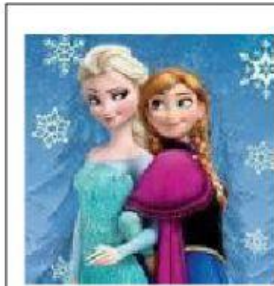
Elsa and Anna