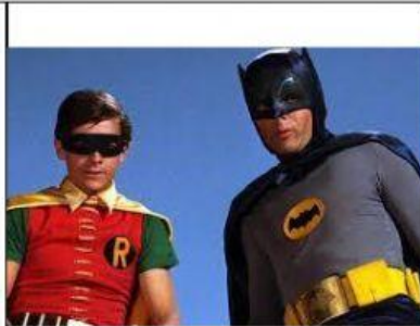
Batman and Robin