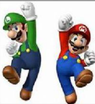
Mario and Luigi