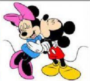
Minnie and Mickey