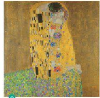
The kiss, 1907, by Gustav Klimt.