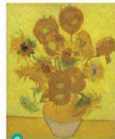
Sunflowers, 1888, by Vincent van Gogh.

_____ including paintings, _____ and _____. Today his _____ are among the world's most famous and expensive works of art.