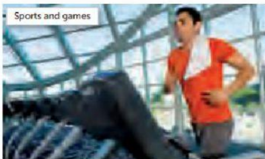
Sports and games