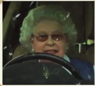
THE QUEEN ..... HOME.