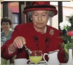
NEXT, SHE ..... AFTERNOON TEA.