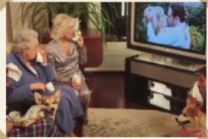
THE QUEEN AND HER FAMILY ..... LIVEWORKSHEETS