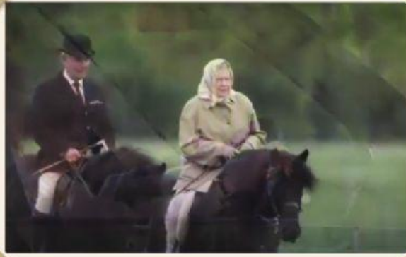
THE QUEEN AND HER FRIEND ..... HORSES.