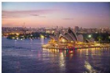
Opera House - Sydney