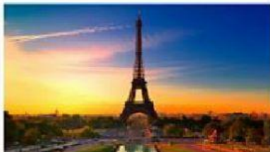
Eiffel Tower - Paris