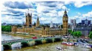
Big Ben - Londres