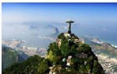
Christ the Redeemer – R.J.