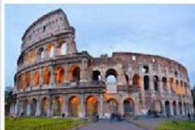
Coliseum - Roma