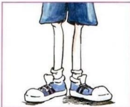
5 These are ..... shoes.