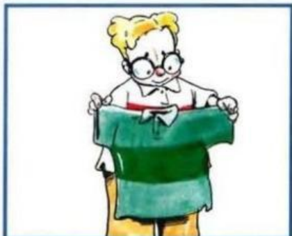
1 Brian / shirt / green Brian's shirt is green.