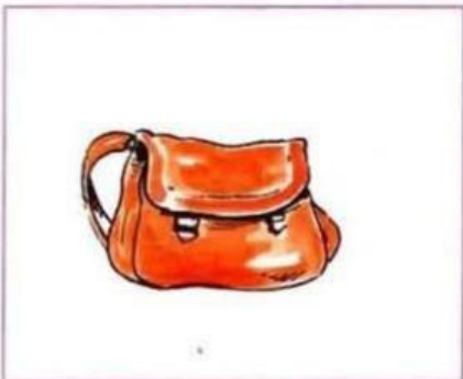
4 This is ..... schoolbag.