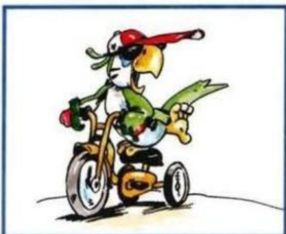
5 Corky / bicycle / yellow