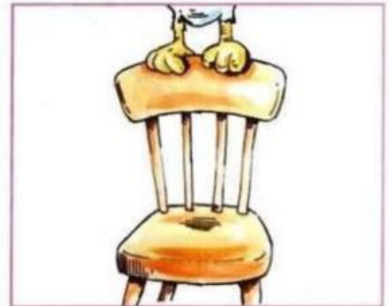
6 This is ..... chair.