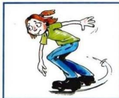
6 Emma / rollerblades / black