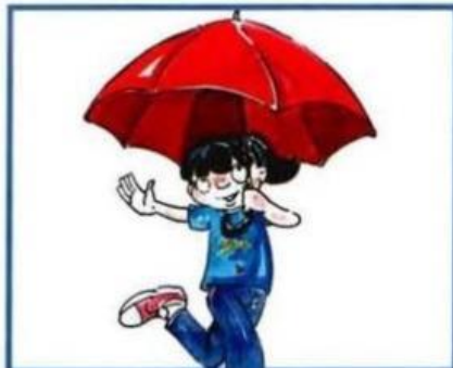
2 Zoe / umbrella / red