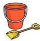
bucket and spade