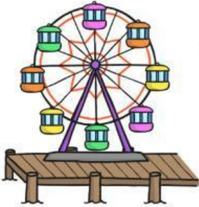
pier and wheel