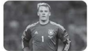
4 _____ from Germany.