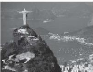
5 B _____