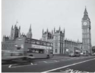
2 E _____