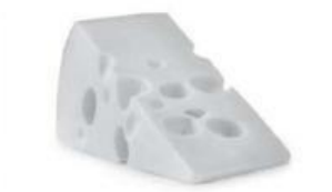
8 _____ from Switzerland.