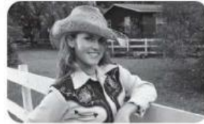
1 She's _____ from the United States.

a Complete the sentences with He's, She's, or It's .