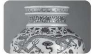
2 It's _____ from China.