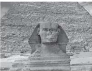
7 E _____