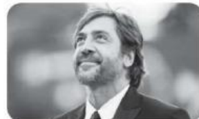
7 _____ from Spain.