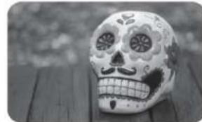
5 _____ from Mexico.