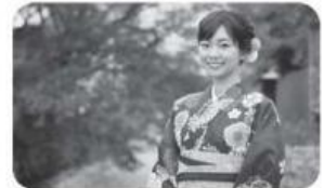
6 _____ from Japan.