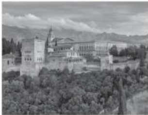
4 S _____