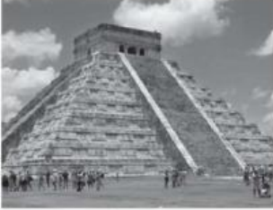
1 Mexico _____