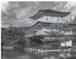
6 J _____