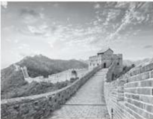
3 C _____