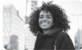
3 _____ from Italy.