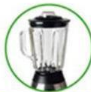
b _ _ d _ _