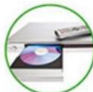
D _ _ p _ _