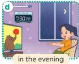
in the evening