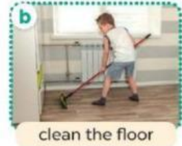
clean the floor