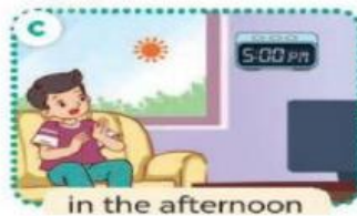
in the afternoon