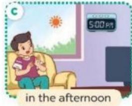
in the afternoon