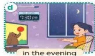
in the evening