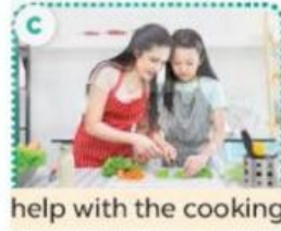
help with the cooking