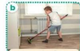
clean the floor