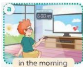
in the morning