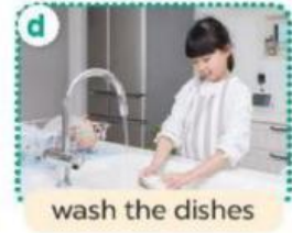
wash the dishes