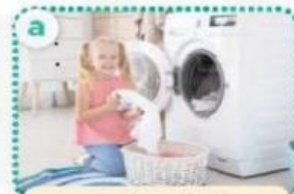
wash the clothes