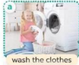
wash the clothes