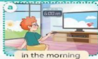
in the morning