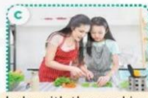
help with the cooking