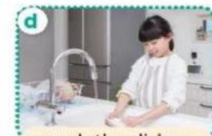
wash the dishes