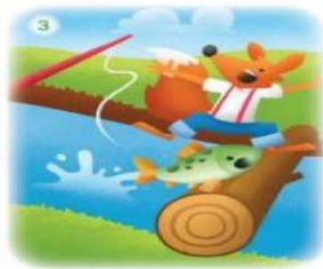
The fish hops. It doesn't like the rod!