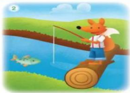
He stands on a log and uses a rod.