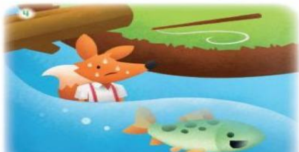
The fox hops, too. He gets wet!