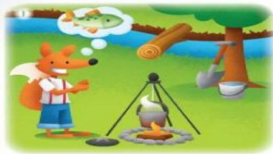
The fox has a hot pot.