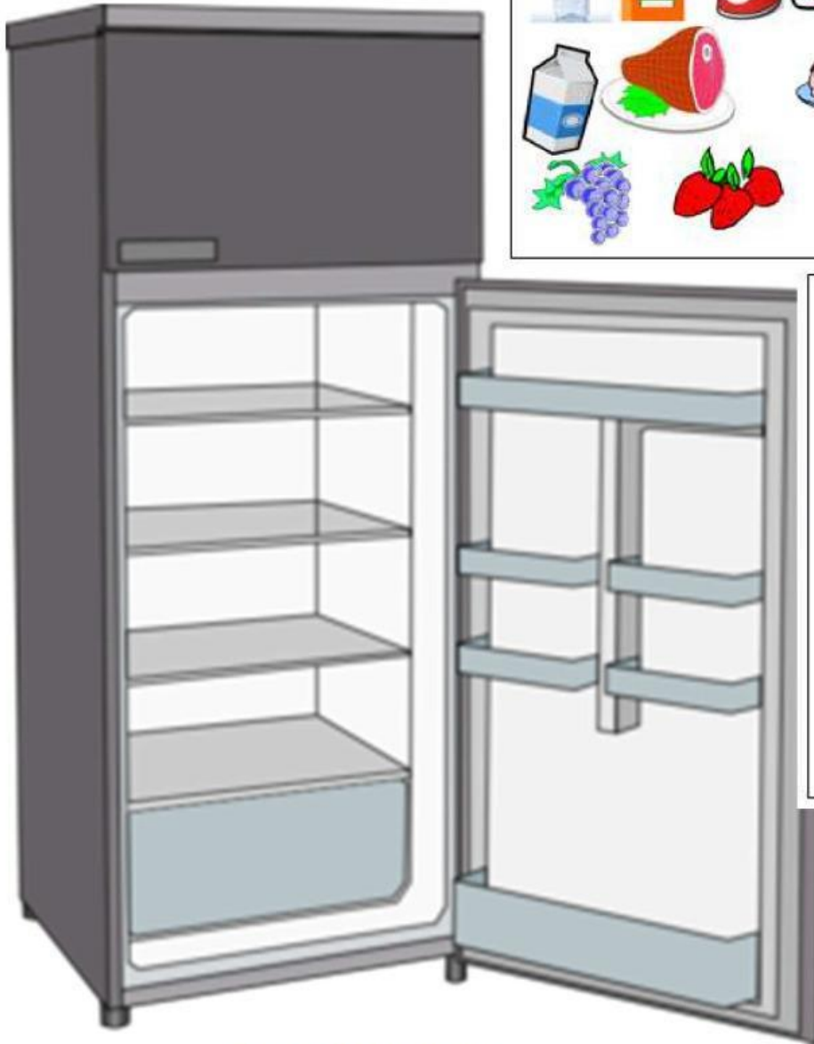
Your partner's fridge