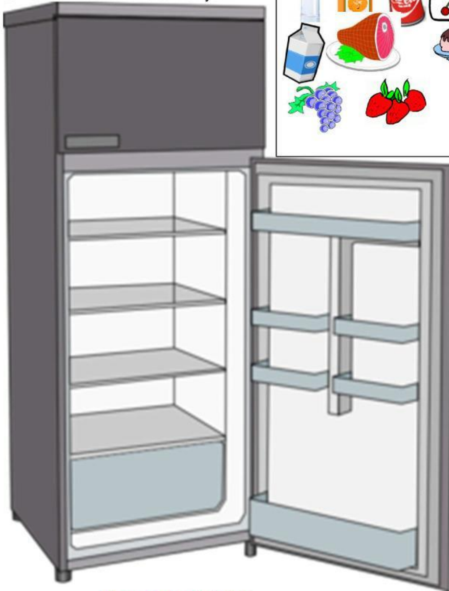
Your partner's fridge