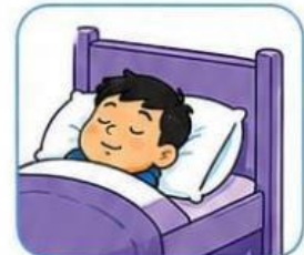
go to bed tidur