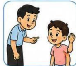
help my parents membantu orang tua