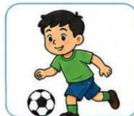
playing soccer bermain sepak bola