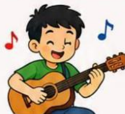
play guitar (bermain gitar)