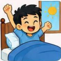
wake up (bangun tidur)