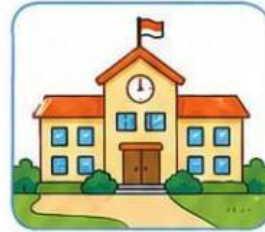
go to school pergi ke sekolah