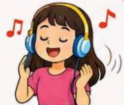
listen to music (mendengarkan musik)