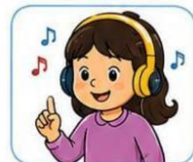
listening to music mendengarkan musik