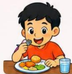
eat breakfast (sarapan)