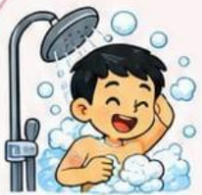
take a shower (mandi)