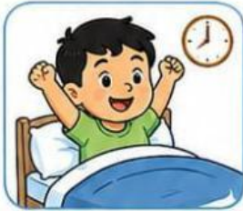
wake up bangun tidur

I do many activities every day. (Saya melakukan banyak kegiatan setiap hari.)