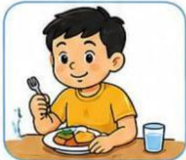
eat breakfast sarapan