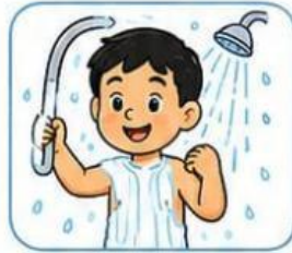
take a shower mandi