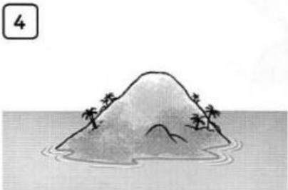
4 ildasn _____