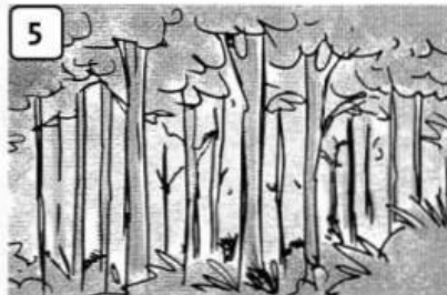
5 foerrasint _____