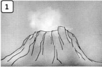
1 anovocl volcano