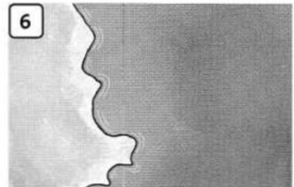
6 neoca _____