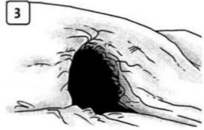
3 evca _____