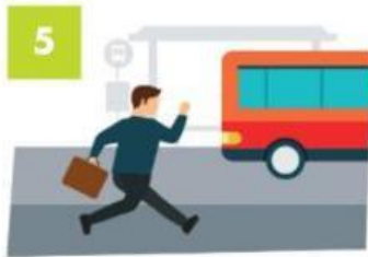
catch the bus