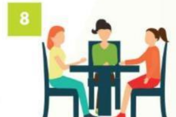
relax with friends